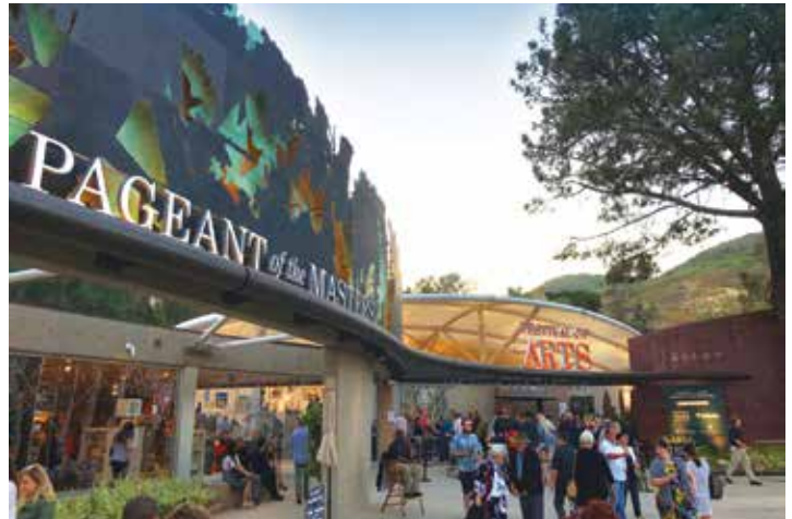
Entrance to Festival of Arts and Pageant of the Masters