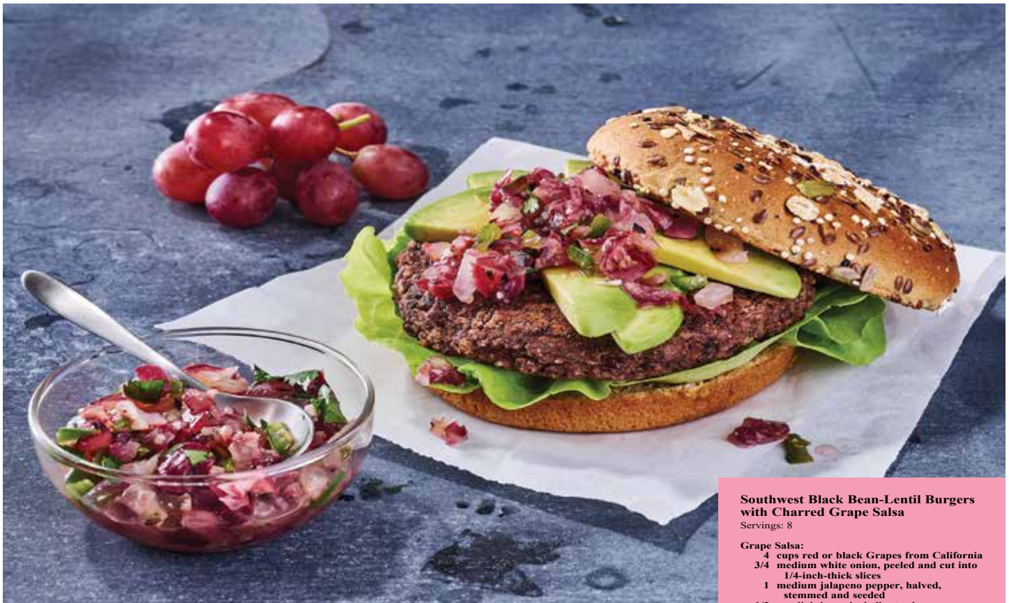
Southwest Black Bean-Lentil Burgers with Charred Grape Salsa