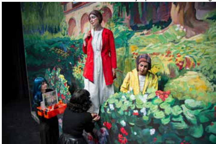
Red And Green

promoting, producing, and sponsoring events that inspire appreciation, study, and participation in the arts. For over 90 years, it has produced two world-class events: The Festival of Arts Fine Art Show and the Pageant of the Masters. Together both shows attract more than 200,000 visitors to Laguna Beach. For general information visit www.foapom.com or call (949) 494-1145.