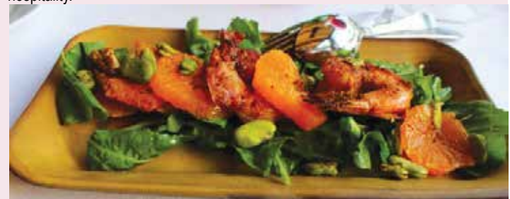
Piment d'Espelette marinated Baja shrimp with fava beans, green garlic, arugula, and Shaner Family Farms tangerines

With service that addressed us formally by last name, a kitchen that refuses to compromise on quality, and a wine program steeped in history and care, A.R. Valentien is delivering a dining experience worthy of Michelin consideration. I'll go on record now, this team is charting a course straight toward a Michelin star. They've earned it. Celebrate your next special occasion here! Get more info at lodgetorrey.pines.com.