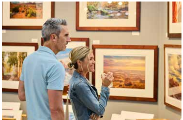
Patrons looking at art at the Festival of Arts Fine Art Show

Pageant of the Masters and Festival of Arts, follow the Festival on social media at @FestivalPageant and visit www.foapom.com .