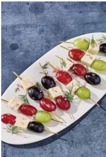
Frozen-Yogurt Grape and Coconut Bites

Nutritional information per serving: 170 calories; 5 g protein; 11 g carbohydrates; 11 g fat (58% calories from fat); 7 g saturated fat (37% calories from saturated fat); 20 mg cholesterol; 240 mg sodium; 1 g fiber.