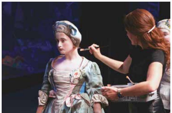
Lovers In A Park