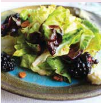
Blackberry Salad with soft lettuces, fresh blackberries, pecans