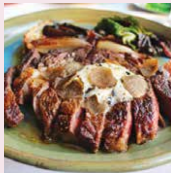
12oz Brandt Beef Prime Ribeye