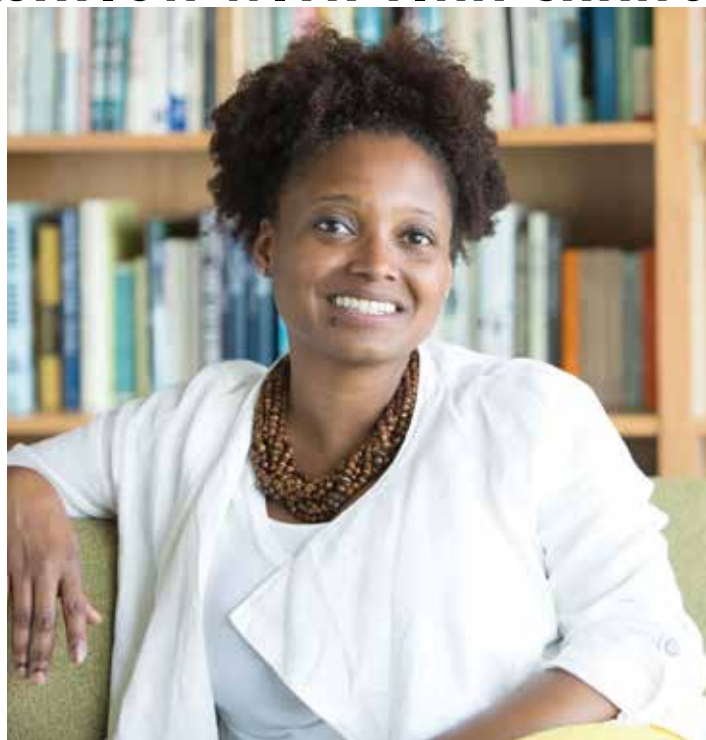
American poet Tracy K. Smith

Tickets for Tracy K. Smith IN CONVERSATION start at $44.07 and are available for purchase online at scfta.org , in person at 600 Town Center Drive, Costa Mesa, CA 92626, and by phone at (714) 556-2787. For inquiries about group ticket discounts of 10 or more,