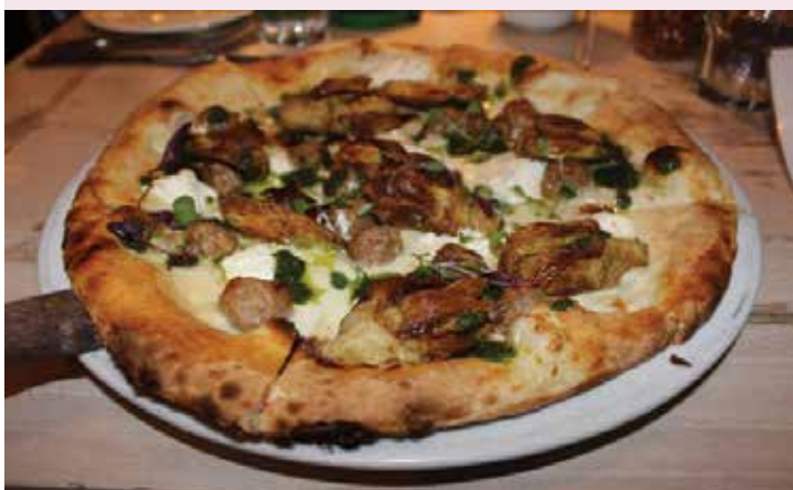
Pizza Salsiccia, Ricotta e Pesto with ricotta cheese, Italian sausage, fresh pesto, and crispy fried artichokes