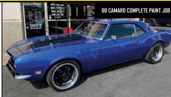
68 CAMARO COMPLETE PAINT JOB